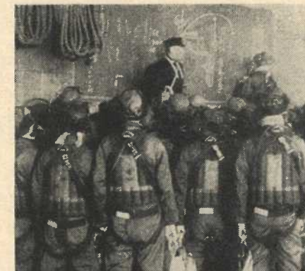
JAPANESE ARE BRIEFED