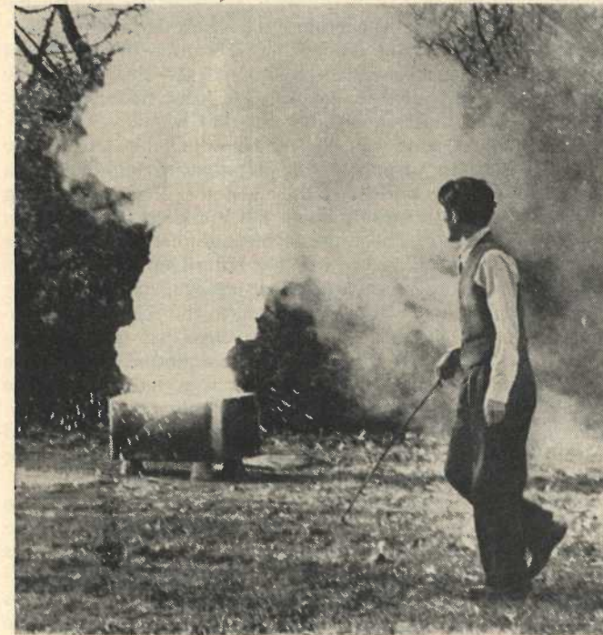
WASHINGTON SCENE, DEC. 7, 1941 In the back yard of the Japanese Embassy, a diplomat watches as documents are burned

Another astonishing feature connected with this last denial was that the time-of-delivery message definitely established that Pearl Harbor would be the scene of the attack. Added to the earlier evidence, there was no other plausible deduction. We have seen that there were only two attractive objectives