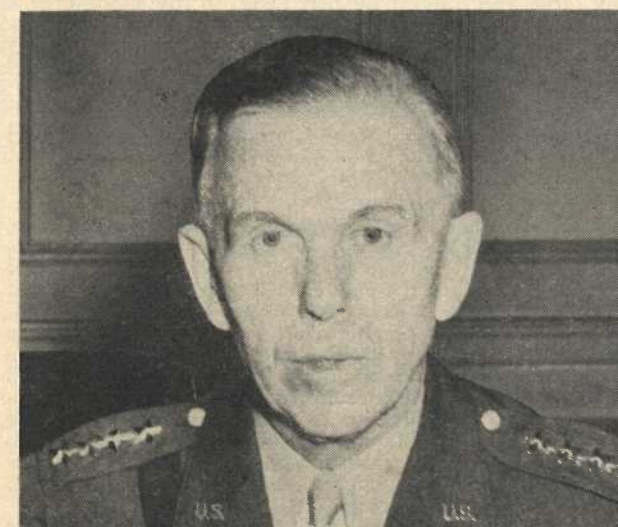
GEN. GEORGE C. MARSHALL Then, Army Chief of Staff

These photos, from captured Japanese newsreels, show how the attack was carried out