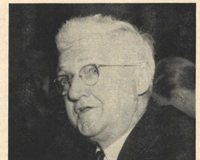
ADMIRAL HAROLD R. STARK Then, Chief of Naval Operations