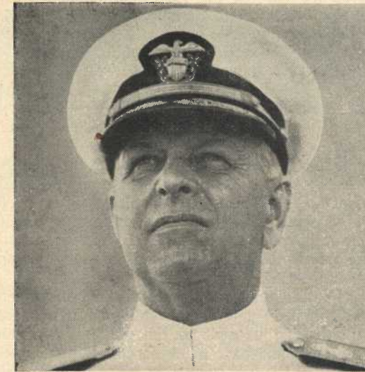
ADMIRAL HUSBAND E. KIMMEL Commanded Pacific Fleet

Photographs on this page all were taken in 1941