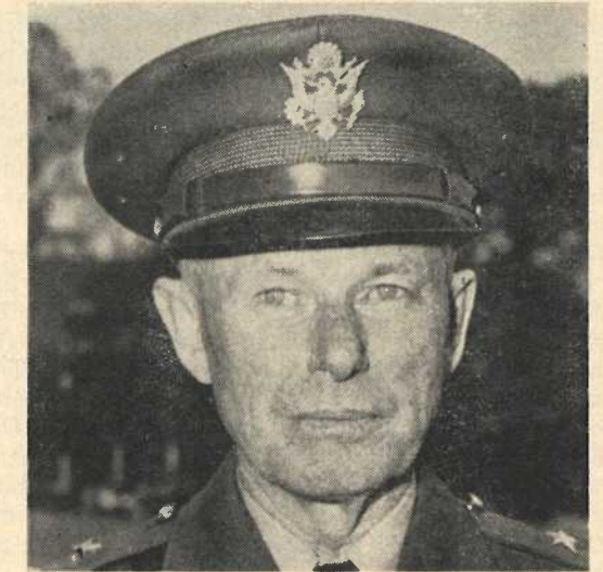
LIEUT. GEN. WALTER C. SHORT Commanded Hawaiian Department